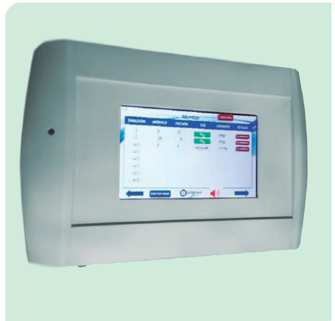
Medical Gas Master Panel

"Arigmed Interface" will be required to connect on medical gas master panel also a good fix quality internet source, status network can be displayed on HTML arigmed web site. System can send network alarm events to a registered email address "on real time".